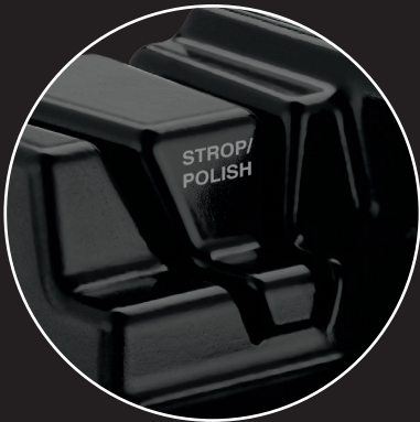
Stropping wheel for more efficiency