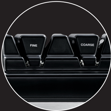
Fine and coarse grinding wheels